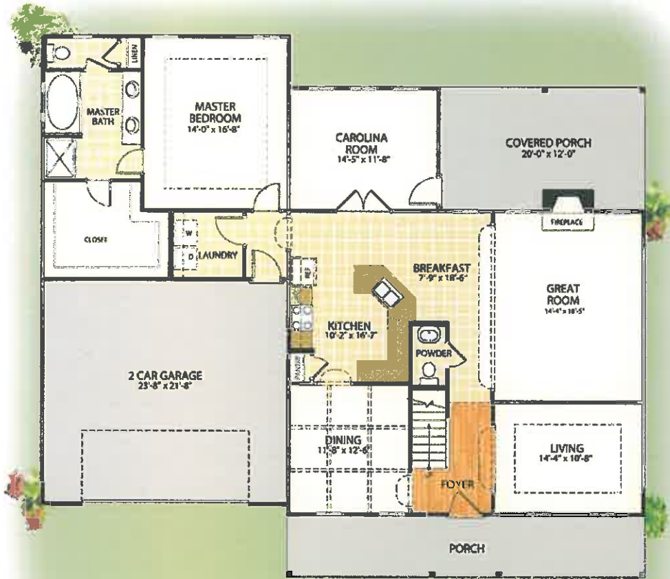
FIRST FLOOR PLAN ELEVATION